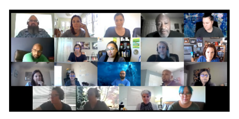
Diversity Leadership Council